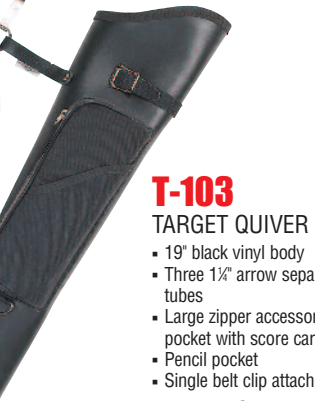
19" black vinyl body • Three 11/4" arrow separator Large zipper accessory

Available Options: Right or Left Hand Black Leather Burgundy Leather