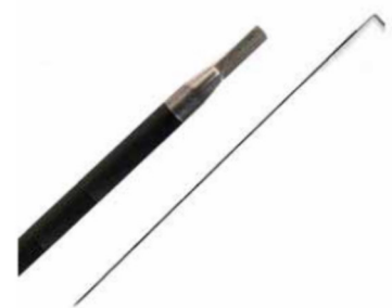
WEIGHT ADJUSTMENT TOOL F.O.C.O.S WEIGHTS

Products are protected by United States Patent Nos. patent #US 10,203,185 B1