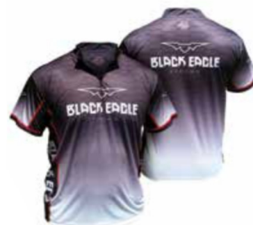
BRANDED TEAM JERSEY