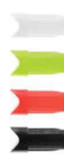
HALF-MOON NOCK 8 Grains