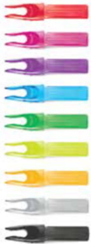
STANDARD-NOCK 10 Grains