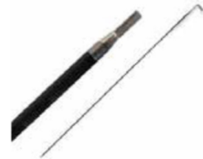
WEIGHT ADJUSTMENT TOOL +.204 ID SHAFTS