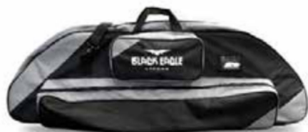
BRANDED BOW CASE

We stock gear that looks great, is durable, and is ultra-light. Our apparel is perfect for sending carbon down-range. For more Black Eagle Arrows gear, check out our store or search for dealers on BLACKEAGLEARROWS.com .