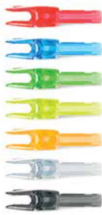
'M' MICRO-NOCK 7 Grains