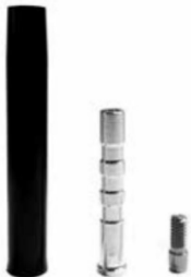
FRONT OF CENTER OUTSERT SYSTEM STAINLESS STEEL OUTSERTS 100 Grains ALUMINIUM OUTSERTS 80 Grains

Our New Front Of Center Outsert System is designed for those that want more weight upfront and ease of use of Outserts. The F.O.C.O.S is made of 3 parts. One is the black anodized 7075 T6 aluminum alloy outsert or Stainless Steel Option. Two is a Stainless steel Retention post In The Aluminum Outsert Model and Aluminum in the Stainless Steel Outsert Model that also acts as a footer inside the shaft. The third part is the 3/32 allen head retention screw that allows for the Outserts to either be screwed or screwed and glued.