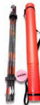
BRANDED ARROW TUBE