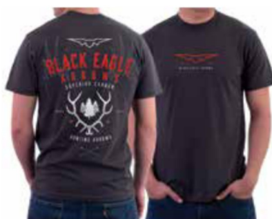
NEXT LEVEL HUNTING T-SHIRT