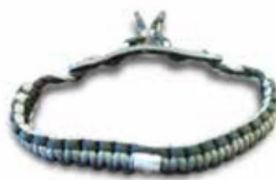
BRANDED BOW SLING