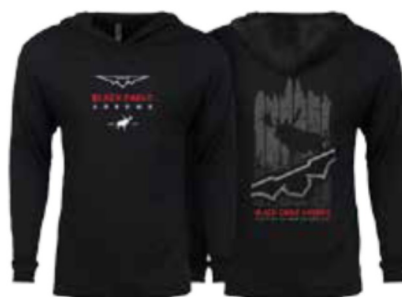
NEXT LEVEL LONG SLEEVE HOODIE