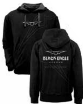
BRANDED HOODED SWEAT SHIRT