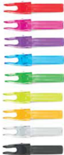
R-NOCK 9 Grains